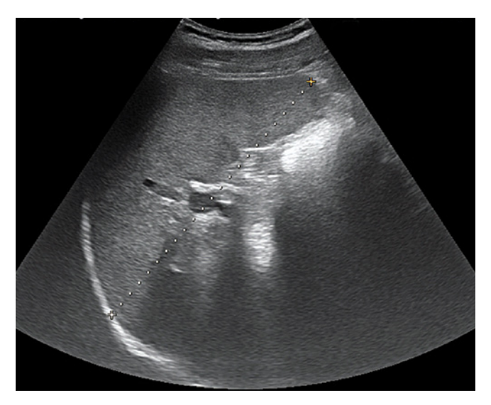
Fig. 1. Measurement of splenic length from the dome to the tip

For the measurement of SL, each child was placed in a supine and right lateral decubitus position. The measure-