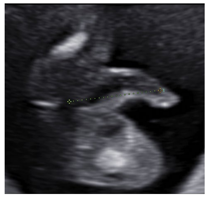
Fig. 3. Cystic penis with dilated penile urethra (the urethral meatus was clearly seen)