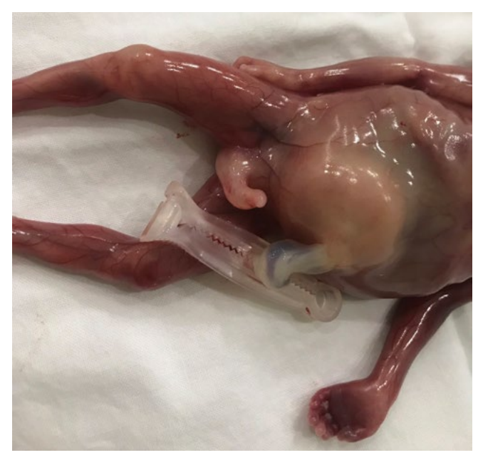
Fig. 4. Post-mortem examination confirmed an enlarged and dorsally curved penis