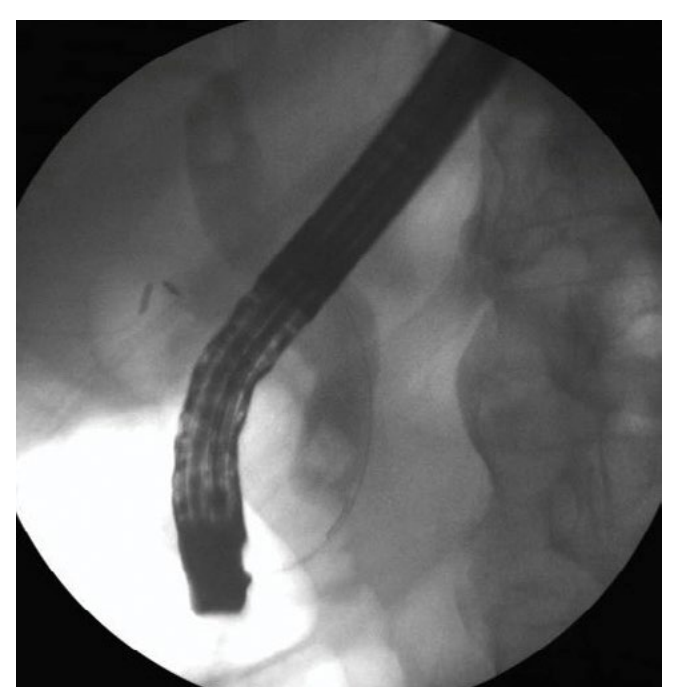
Fig. 1. Initial cholangiogram revealing two 8 mm stones in the common bile duct