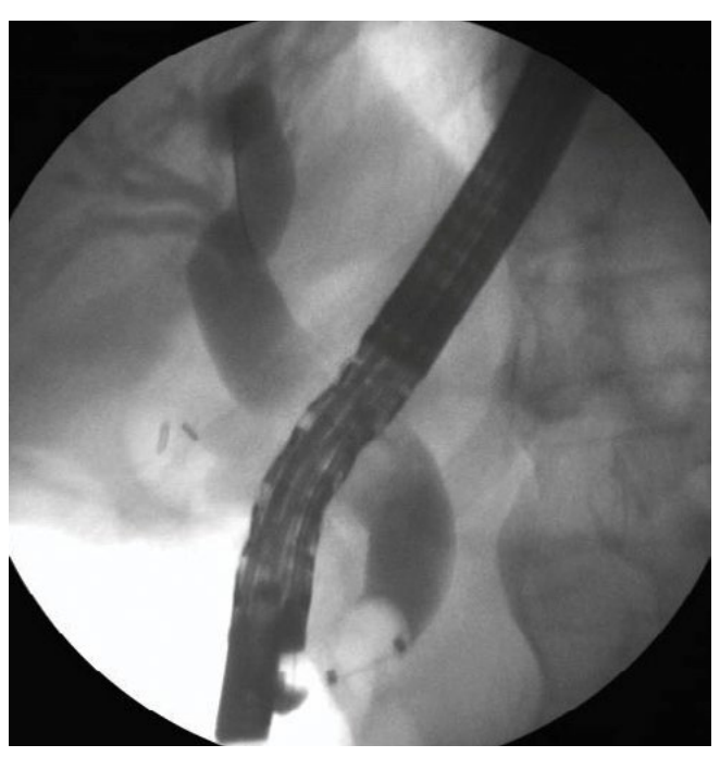
Fig. 2. Control cholangiogram at the end of the ERCP procedure confirming stone clearance. No obvious radiologic signs of perforation were seen by the examiner