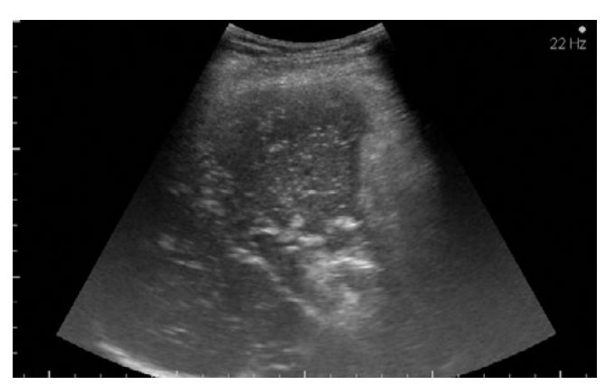
Fig. 3. Echogenic particles flowing within the portal vein and inferior vena cava, and multiple non-shadowing echogenic foci within the liver parenchyma consistent with the presence of intrahepatic portal venous gas

The patient was transferred to the intensive care unit for stabilization. A second ultrasound examination performed 8 hours later revealed a marked reduction in the number of microbubbles (Video 2 – available at www.jultrason.pl), while computed tomography performed 4 hours afterwards showed massive retropneumoperitoneum (Fig. 4), though the intrahepatic portal venous gas was no longer visible. Surgical intervention was performed on an emergency basis with debridement and multiple drainage of the retroperitoneal cavity (Fig. 5). The patient's condition improved slowly, and he was discharged 4 weeks later.