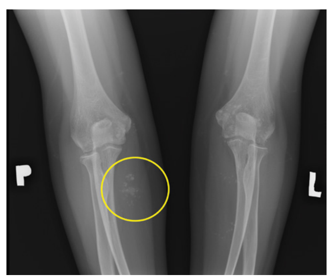
Fig. 3. Calcinosis cutis in a 15-year-old male patient with scleroderma

activity, or fibrosis of affected tissues. Such information would be highly appreciated by pediatricians.