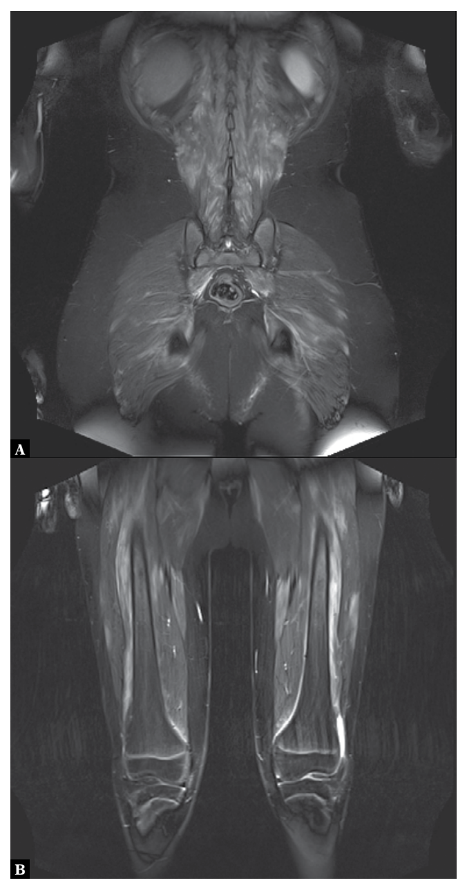
Fig. 4. Whole body MRI in PD FS sequence, coronal views in a juvenile with scleromyositis: A. increased signal of paravertebral and gluteal muscles, B. increased signal of thigh muscles bilaterally (arrows)

are less frequent, but can be found in MRI images in jLS, the last is exclusively seen on MRI. MRI may especially be needed in the overlapping syndromes, which most commonly concern scleroderma and dermatomyositis (scleromyositis); MRI is the imaging modality of choice for the latter (Fig. 4).