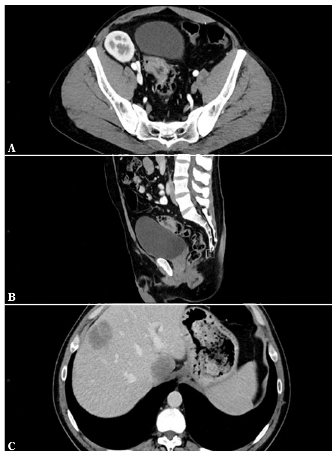
Fig. 2. CT in the initial staging of a rectosigmoid junction tumor. Axial (A) and sagittal (B) sections through the tumor. Axial section in the upper abdomen (C) showing the presence of liver metastases

to image many different structures, such as abdominal viscera, pelvic organs, lungs and bones, with a single examination. The presence of ionizing radiation limits the usage of CT. The American College of Radiologists (ACR) has summarized the indications for abdominal CT (Tab. 3) (20) .