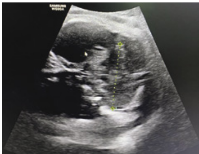
Fig. 1. 2D gray-scale ultrasound of a pregnant woman at 37 weeks GA showing TCD measuring 52.5 mm corresponding to 37 weeks GA