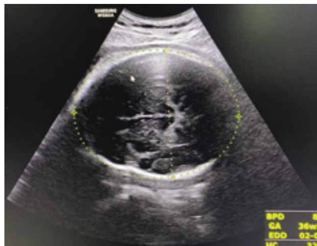
Fig. 2. 2D gray-scale ultrasound of a pregnant woman at 37 weeks GA showing BPD measuring 89.9 mm corresponding to 36 weeks + 2 days GA

in fetuses with achondroplasia, and abnormalities in the amniotic fluid volume also decrease the accuracy of FL measurement by ultrasound (6) .