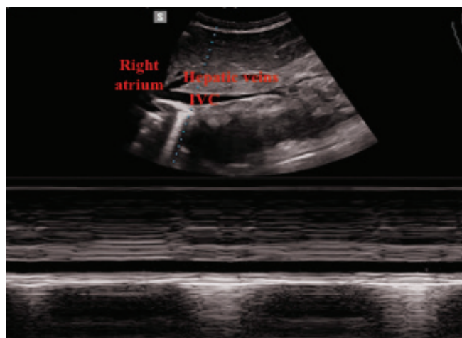
Fig. 1. M-Mode images of the inferior vena cava draining into the right atrium